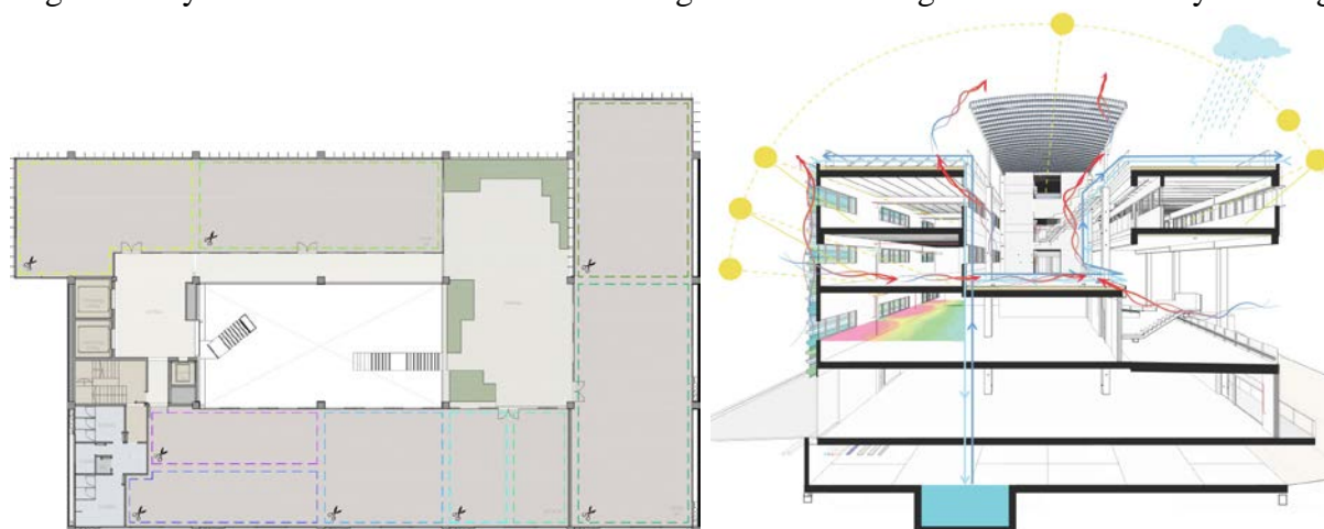
Figure 1. Type floor plan with interior subdivision schemes (left) and section (right) of the Socrates building.

Another keystone in the design was to support direct access to nature and open spaces with vegetation, natural ventilation and direct access to daylight and views. Each floor plan possesses open space equipped with vegetation, irrigated with recovered rainwater. The LEED v.4 certification protocol was adopted to better structure all of the aspects related to sustainability, this decision was taken in accordance with an analysis of the office buildings market in Barcelona where the majority of buildings with environmental certifications have a higher real estate value and higher rental potential (Eje Prime, 2018). A final practical aspect of the design and construction phase was the implementation of an integrated delivery process (IDP) that aligned every stakeholder towards the common goal of conceiving a circular economy building.