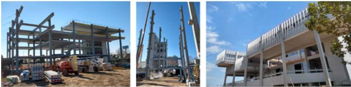
Figure 2. Prefabricated structure during the construction phase of the Socrates building.

The structure is constructed from a prefabricated concrete frame composed of 0,60m x 0,80 m pillars that span the full height of the building as a single element without vertical interruption in addition to horizontal beams with a section of 60 x 80 cm that connects to the vertical structure. Pillars are distributed across a 10 x 10-meter grid, with a 100m 2 free areas that guarantee the highest spatial flexibility for any tertiary and light industrial use. Prefabricated hollow-core slabs complete the horizontal enclosure and give structural stability to the frame.